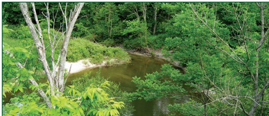
Falmouth has over 2,000 acres of designated conservation land, evenly split between the town and the Falmouth Land Trust, including this parcel that borders all three of the town's rivers.

The group took an inquiry approach to the task, rather than starting out by identifying high-value open space parcels in town. That approach had been tried before and created some landowner resentment. First, the group defined what it meant by "open space," and then generated a long list of questions it wanted answered. Those questions ranged from "How