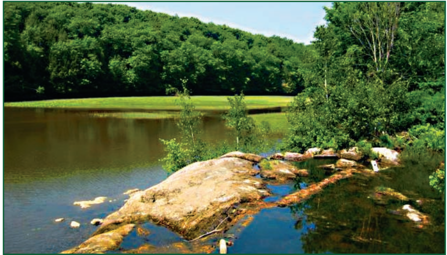
The Lower Cathance River as seen from the top of the 15 ft. waterfall.

It would be wishful thinking to report that conservation supporters in Topsham knew all this fifteen years ago. It is true that long-term residents understood the political culture in which Topsham