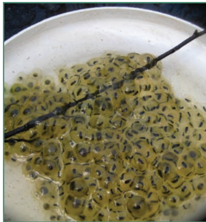
A white Frisbee aids visibility of a cluster of wood frog eggs.

Some of the pools were relatively easy to locate. Others required considerable orienteering and backcountry hiking skills. Brush, grasses, fallen trees, leaves, and natural debris complicated the terrain. If it was raining, or even a slight drizzle, it would pucker the surface of the water, compromising the required visibility. Thus, a slightly overcast day was best, with no strong reflection of sunlight. One volunteer would begin the slow, methodical wading, searching for egg masses along the edges of the pool, counting them, reporting the types of eggs found and numbers of masses so the other volunteer could notate the data. Teams developed their own method for covering the entire pool. Because they were volunteers and not biologists, they needed to provide clear photos of what they found so the scientists could confirm their tentative identifications. Volunteer teams were required to provide photos of each pool and of each type of egg mass. This tricky operation was best done by holding the white Frisbee-like object just beneath the egg mass and, with camera strap securely around the wrist of the other hand, snapping a photo of the eggs. (Most digital cameras are not waterproof). The bottom of potential vernal pools can be a hazard course of submerged branches. Awkward at first, this technique improved with practice.