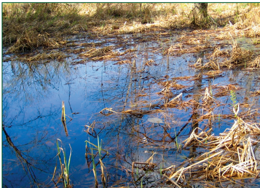
A potential vernal pool in Topsham.

Rubber boots required. Waders preferred. Camera essential.