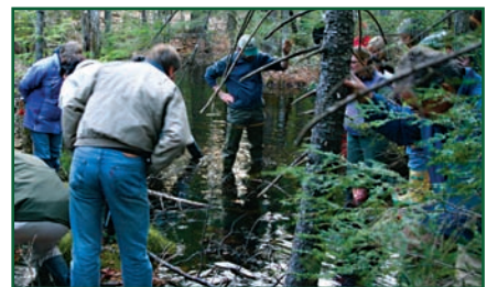
Egg mass identification training at a local vernal pool.