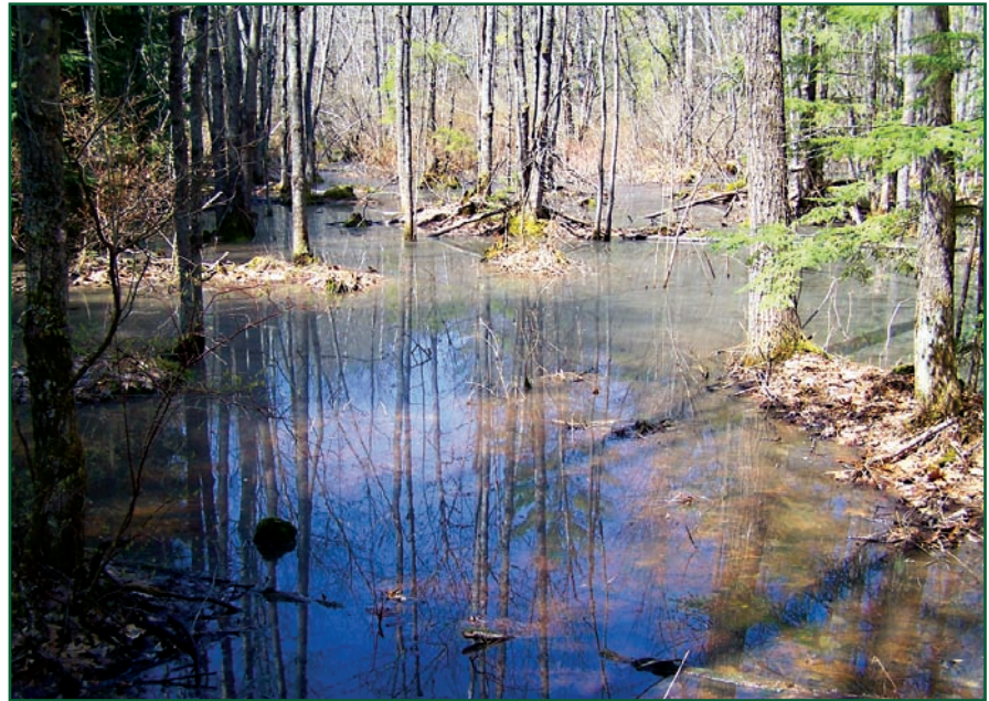
A potential vernal pool in Wayne

“Significant” vernal pools are those with exceptional wildlife value, that attain a scientifically-based threshold of amphibian egg mass numbers, or that are frequented by rare or endangered species. Maine Legislature recognized vernal pools as Significant Wildlife Habitat as early as 1995. A law specifically regulating development in a 250 ft consultation zone around Significant Vernal Pools was implemented in 2007, with the burden of determining a pool’s significance placed on the landowner.